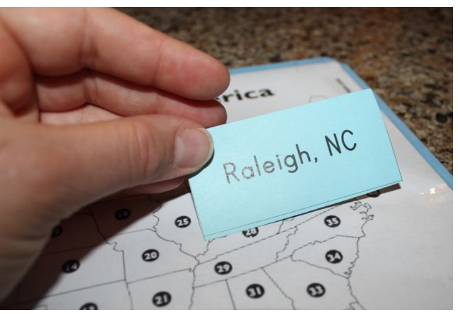
A resource from www.halfahundredacrewood.com