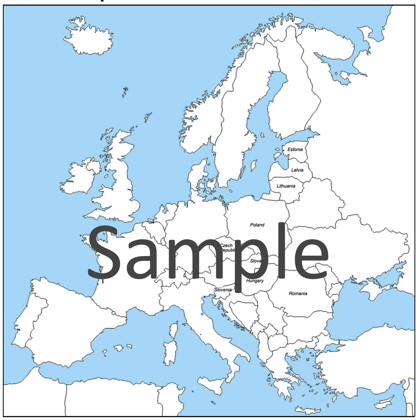
Region #3. Unit 2 - Weeks 1-3 (Repeat Unit 6 - Weeks 1-3). Eastern Europe (Track #6) Lyrics: