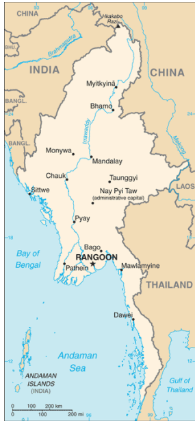
NAY PYI TAW