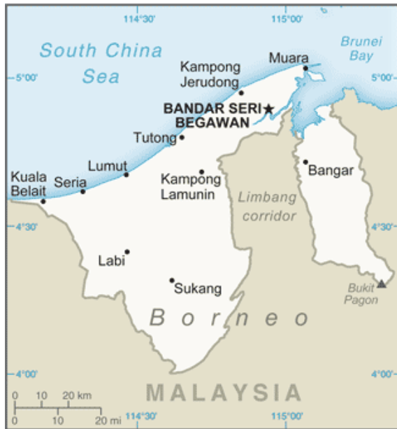
BANDAR SERI BEGAWAN